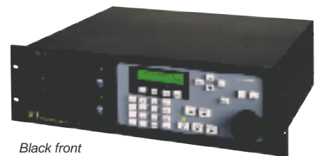
Black front panel version (RCV1)