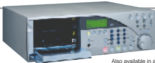
Also available in a lower price black front panel design